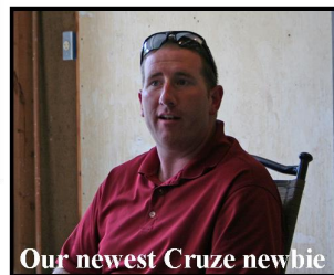
Our newest Cruze newbie