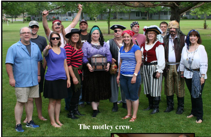
The motley crew.

Black holes are where God divided by zero.