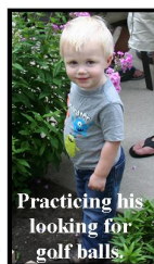
Practicing his looking for golf balls.