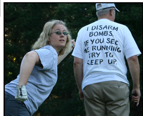
King bell for service. If there's no answer, do it yourself.