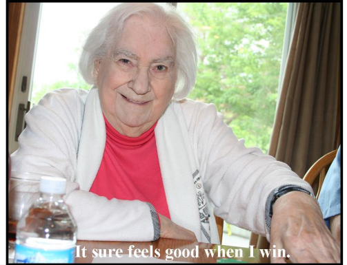
It sure feels good when I win.