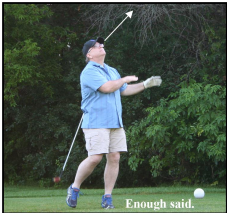
If everything is coming your way, you're probably in the wrong lane.