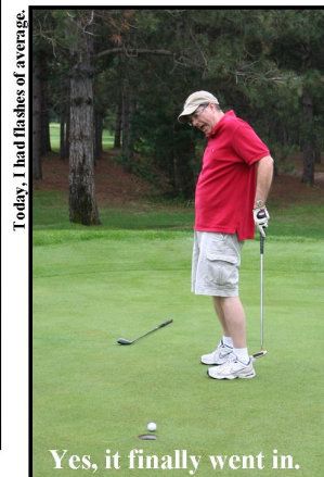
Today, I had flashes of average.