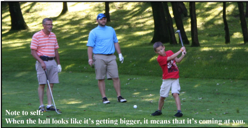
Note to self: When the ball looks like it's getting bigger, it means that it's coming at you.