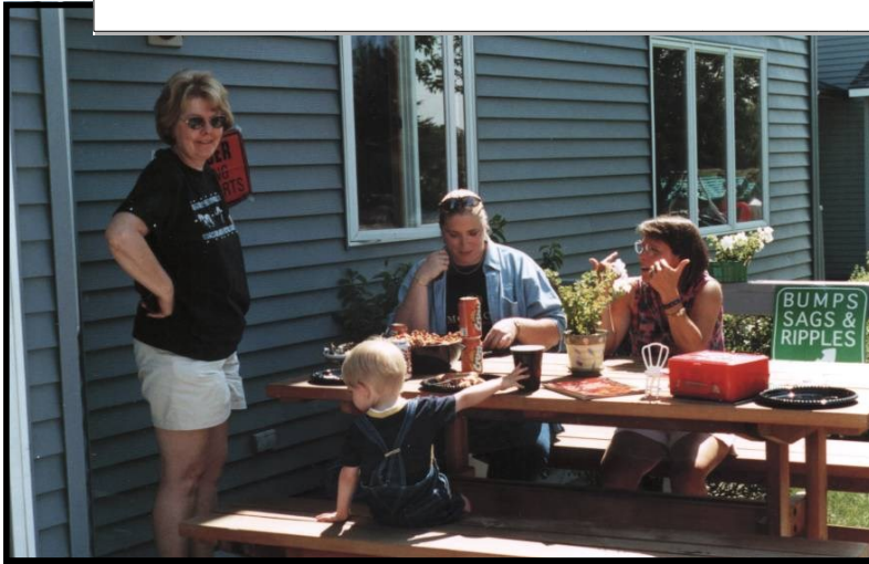
A quiet, out of the way, moment at the party.