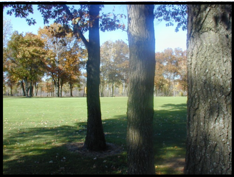
You don't want to be over here.