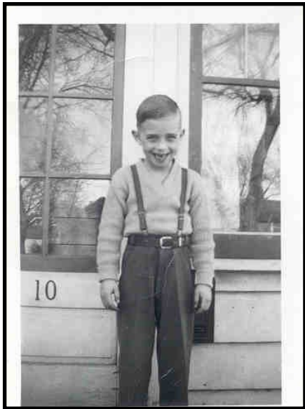
It's a good idea to keep this one straight.

Attention: Important: Listen up: May 10 th is an important date. Once Wapicada receives our down payment, they will give away all unused tee times. If you do not commit by May 10 th , you will not be playing in the tournament. The odds of getting a tee time with the rest of the family after May 10th will be slim at best. You are better off making the non-refundable down payment by May 10 th and then choosing to drop out than to miss the May 10 th down payment and then try to get in later.