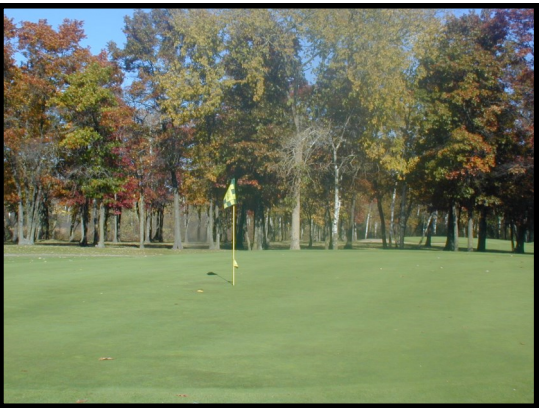
See how easy it's going to be?