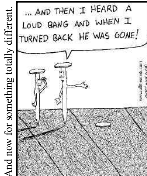
And now for something totally different.

A quick glance at the layout of the course reveals how tight the fairways are.