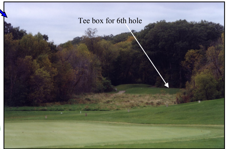
Sixth hole at Whispering Pines Golf Course