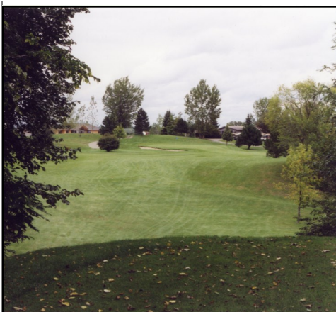
18th hole—Par 3

The winner will be presented with a traveling trophy which will have their