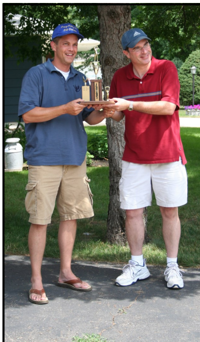
Last year's men's champ presents this year's men's champ with the trophy.