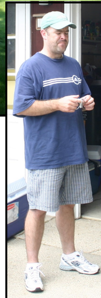
How could I lose? I should've won. I threw it away! Darn! Darn! Darn!