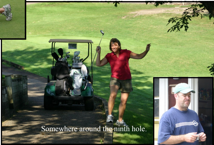
Somewhere around the ninth hole.