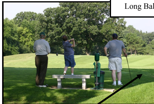
Hey guys, the fairway is over here.