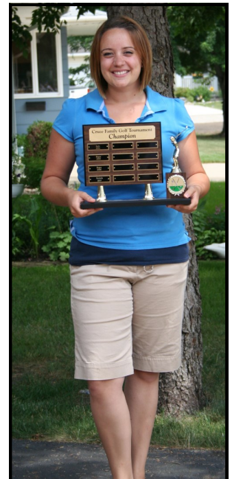
Our woman's champion