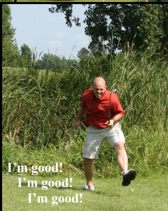
I'm good! I'm good! I'm good!