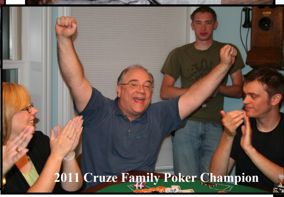
2011 Cruze Family Poker Champion