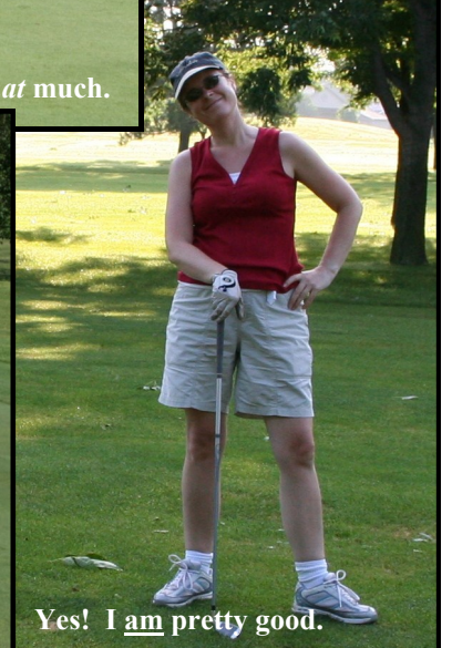
Yes! I am pretty good.