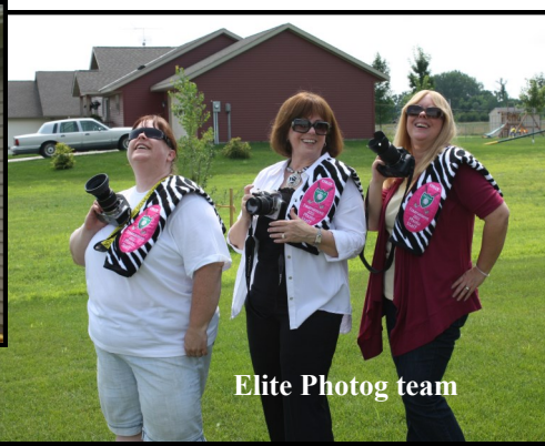
Elite Photog team