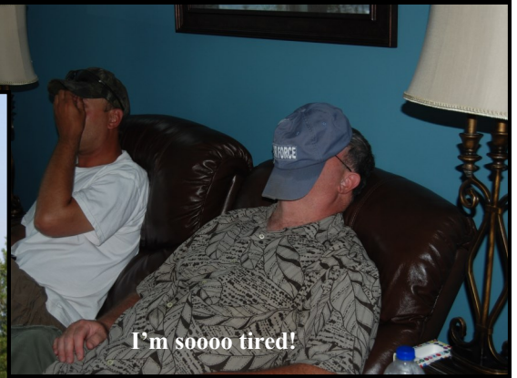
I'm soooo tired!