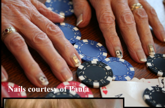
Nails courtesy of Paula