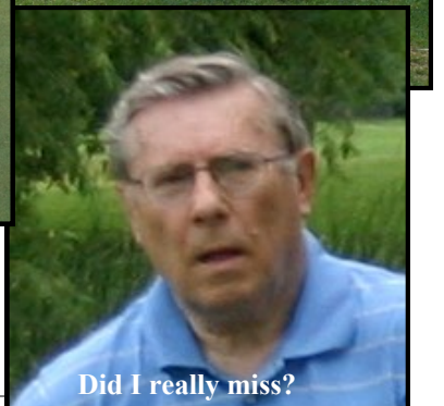
Did I really miss?