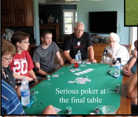
Serious poker at the final table