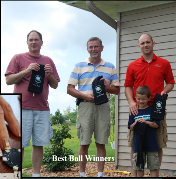
Best Ball Winners