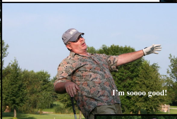
I'm soooo good!