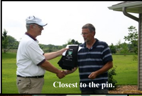
Closest to the pin.