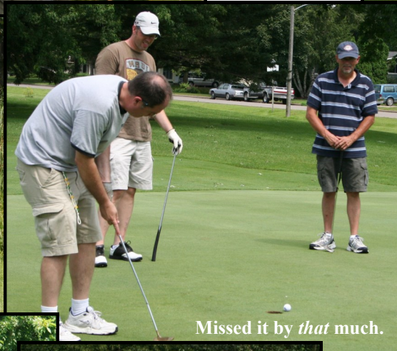
Missed it by that much.