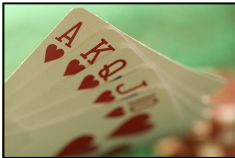
I didn't say it was your fault, I said I was blaming you.