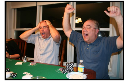
To write with a broken pencil is pointless.