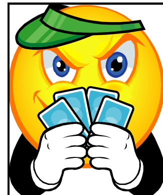
If I argued with you, then we'd both be wrong.