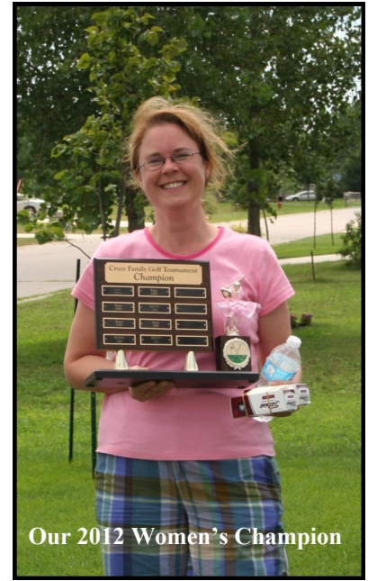
Our 2012 Women's Champion

Cartoonist found dead in home. Details are sketchy.