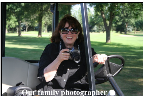
Our family photographer

I'm reading a book about anti-gravity and I can't put it down.