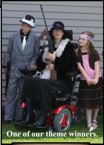
One of our theme winners.