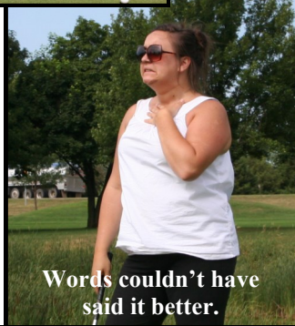
Words couldn't have said it better.