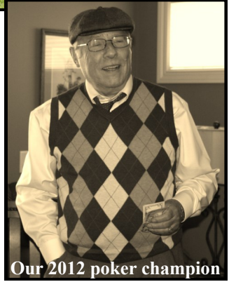
Our 2012 poker champion