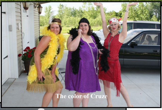
The color of Cruze