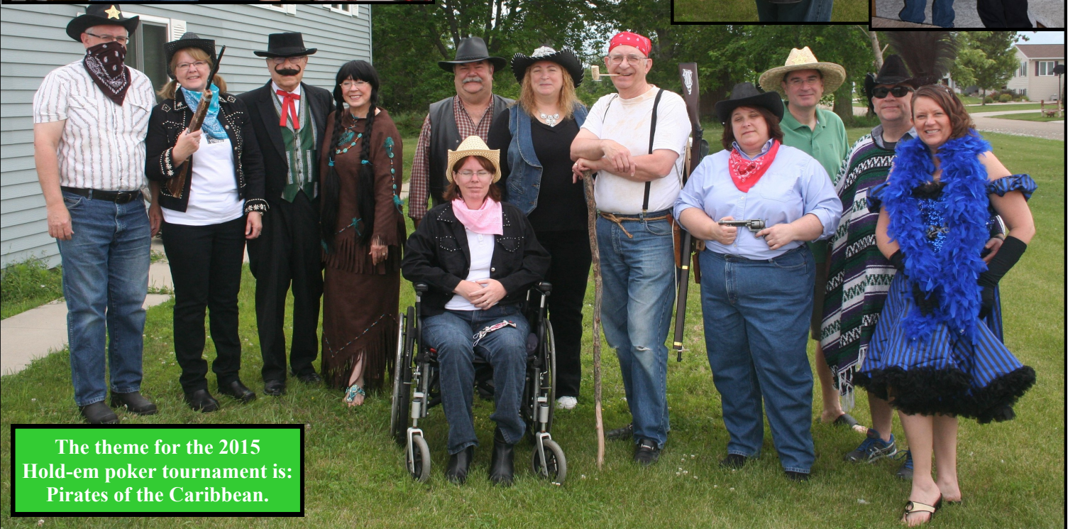
The theme for the 2015 Hold'em poker tournament is: Pirates of the Caribbean.