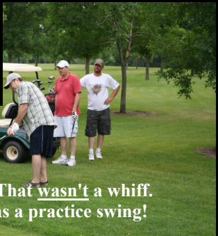
No! That wasn't a whiff. It was a practice swing!