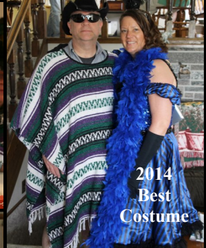
2014 Best Costume