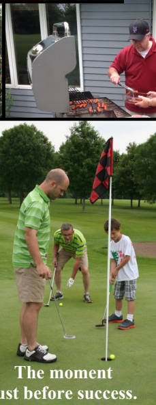
The moment just before success.