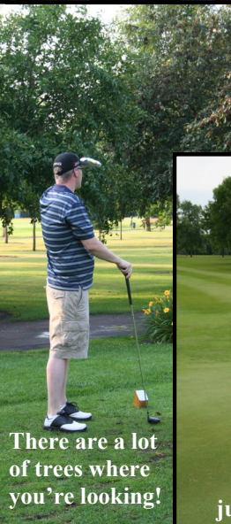
There are a lot of trees where you're looking!