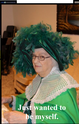
Just wanted to be myself.