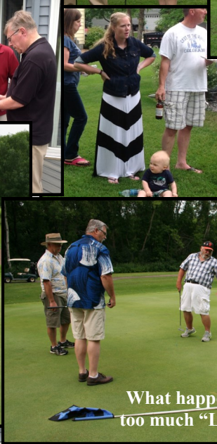
What happens when you put too much "Left English" on it.