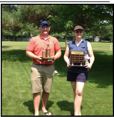
The 2015 Defenders

You know that tingling feeling you get when you see someone that you like? That's common sense leaving your body.