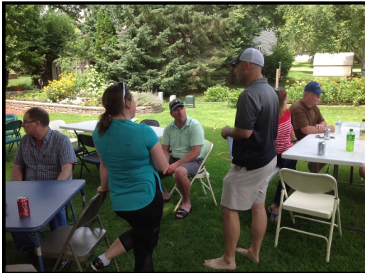
Well, this day was a terrible waste of makeup!