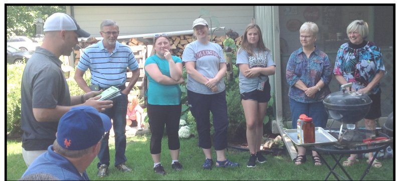
Unattended children will be given Espresso and a free kitten.