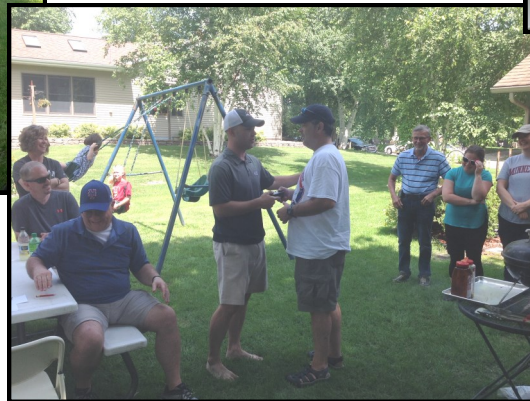
I'm not tense, I'm just terribly, terribly alert.