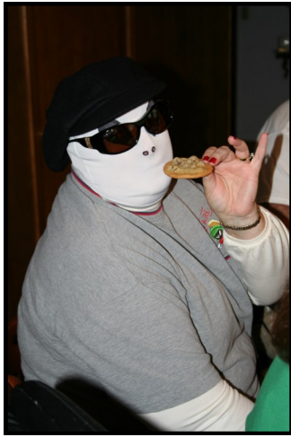
I child proofed my home, but the kids still get in.