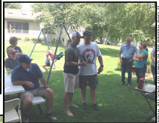
If God wanted me to touch my toes, He would have put them on my knees.