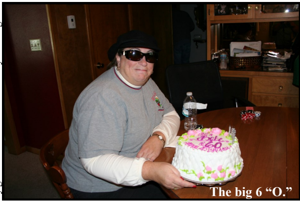
The big 6 "O."

How do they get the deer to cross at those yellow signs?