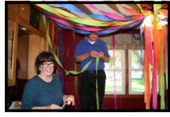
Roman numerals for 40 are XL.