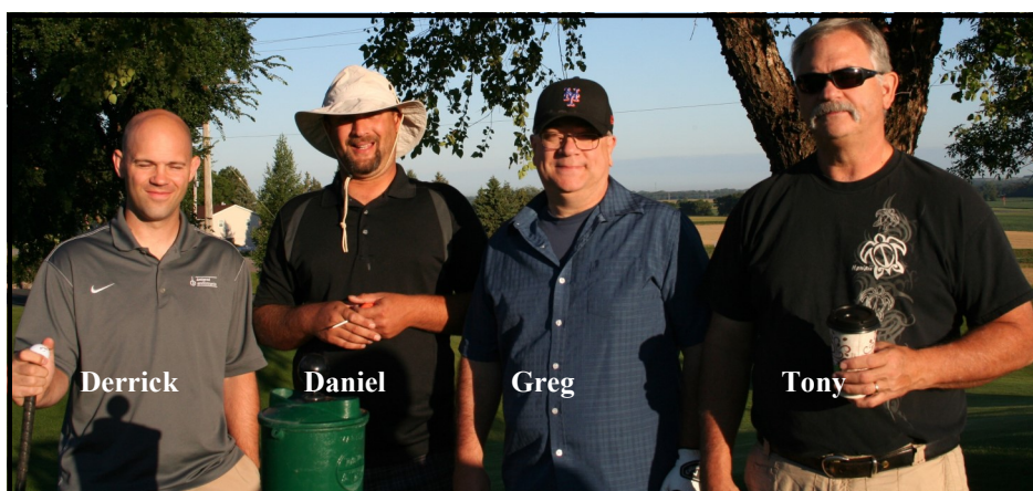
Women like silent men because they think they're listening.