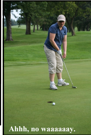
Ahhh, no waaaaaaay.