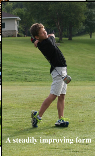
A steadily improving form