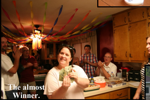
The almost Winner.