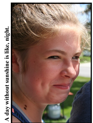
A day without sunshine is like, night.

NOTICE: The location, date, and theme for next year's Texas Hold'em poker tournament hasn't been decided yet. An email will be sent out to everyone later.