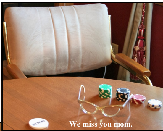
We miss you mom.