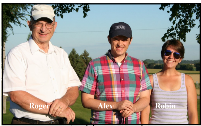
If the #2 pencil is the most popular, why is it still #2?