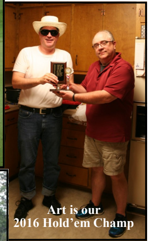
Art is our 2016 Hold'em Champ