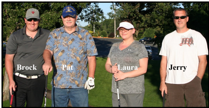
Isn't it nice that wrinkles don't hurt?