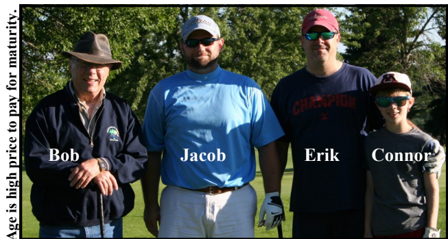
Age is high price to pay for maturity.