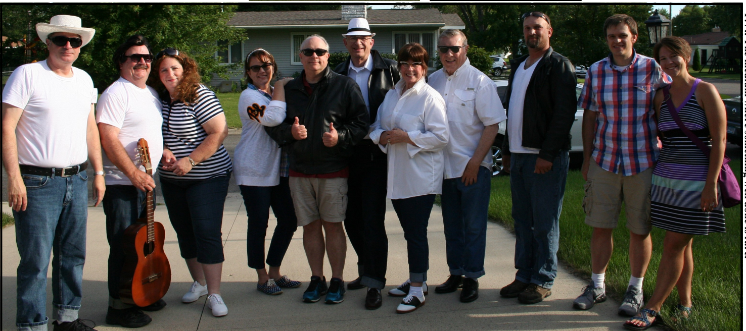
We never really grow up. We only learn how to act in public.