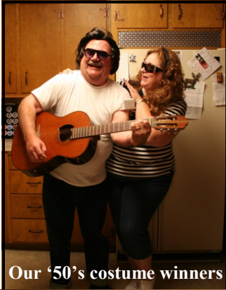
Our '50's costume winners