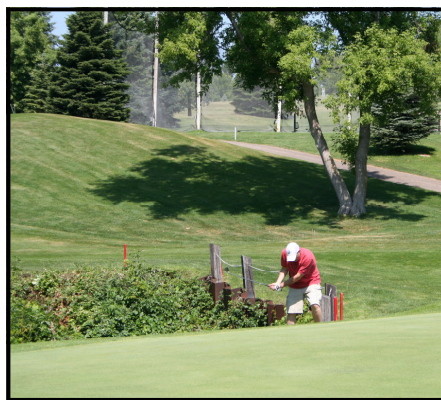
18th hole—Par 5

The winner will be presented with a traveling trophy which will have their name engraved on it for all time and