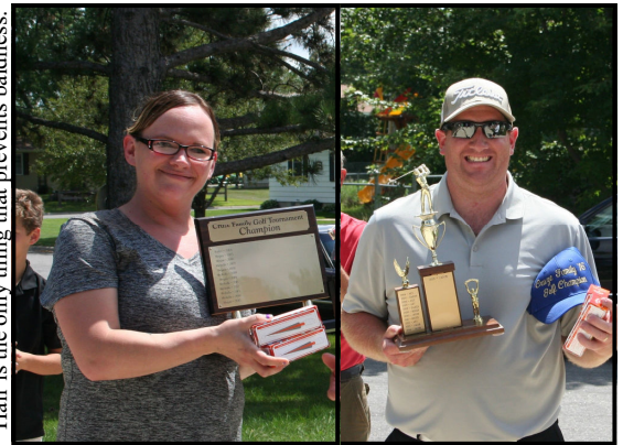
The 2017 Defenders

Hair is the only thing that prevents baldness.