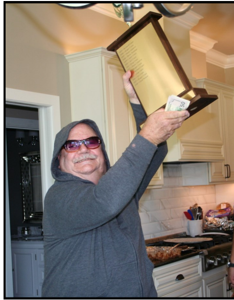
Our 2019 Texas Hold'em Poker Champion!