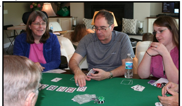
If you're headed in the wrong direction, God allows u-turns.