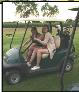
Do not Disturb—Mental back up in progress.