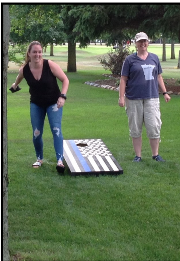
My wife said that I never listen to her, or something like that.