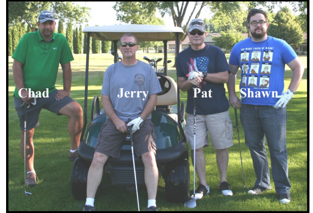
If God wanted me to touch my toes, He would have put them on my knees.