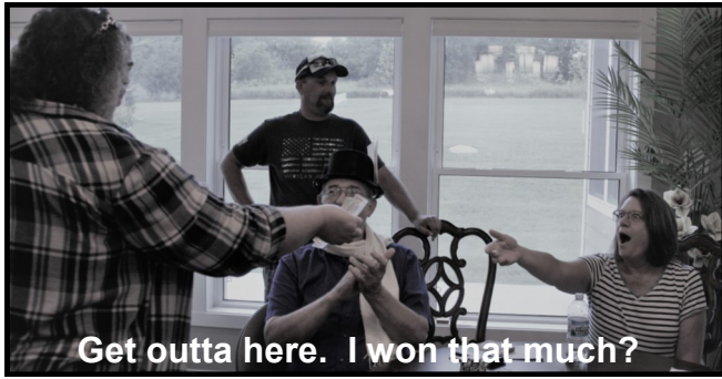
Get outta here. I won that much?