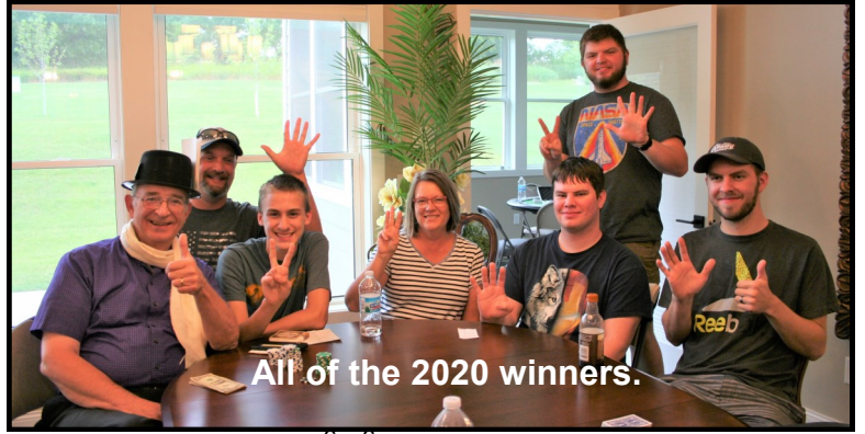
All of the 2020 winners.