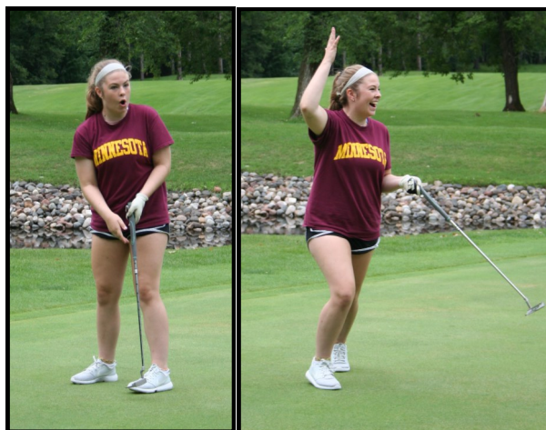
Oooooooh—it might go in. OMG—It went in! (Her birdie on # 17)

Ah, officer, you're not going to check the trunk, are you?