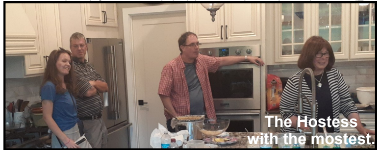
The Hostess with the mostest.