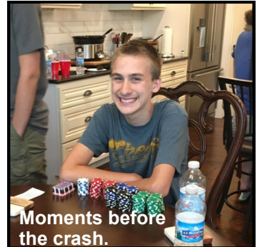
Moments before the crash.