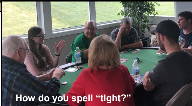
How do you spell "tight?"