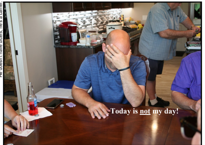
Today is not my day!