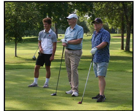
Some drank from the fountain of knowledge, I only gargled.