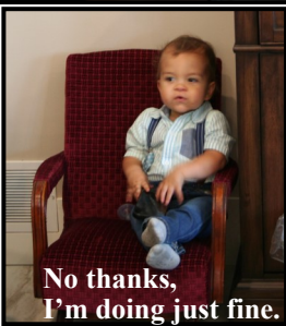
No thanks, I'm doing just fine.

Please note: As of the printing of this edition of the Chronicle, we do not have a volunteer for next year's Texas Hold'em tournament. Please consider volunteering to host next year's game.