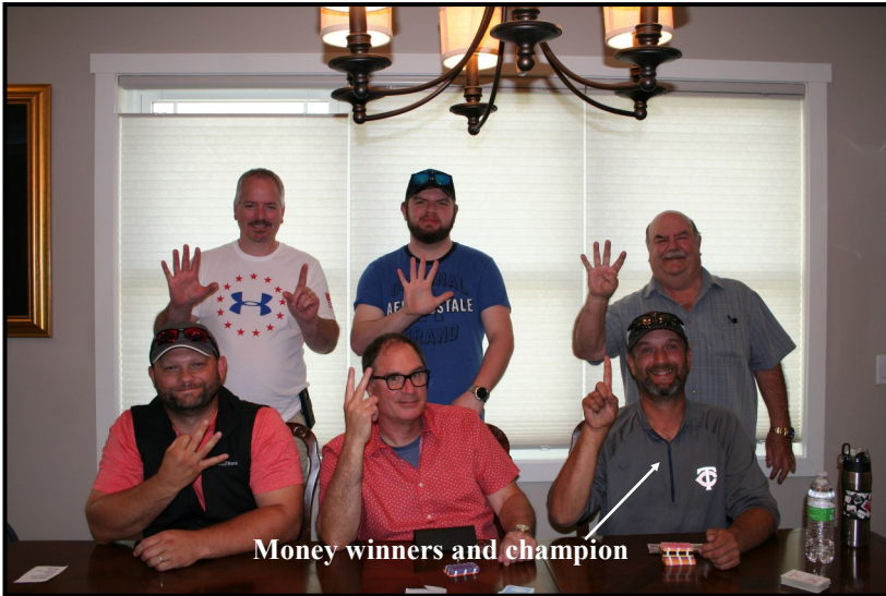
Money winners and champion