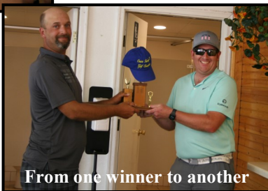
From one winner to another