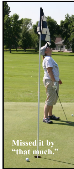
Missed it by "that much."