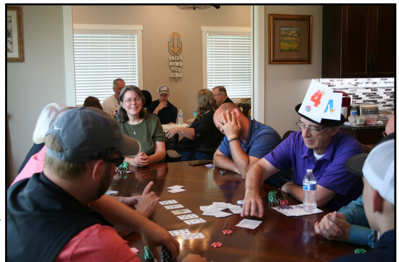
I always wanted to be someone, but I should have been more specific.