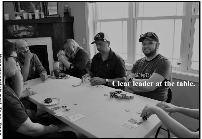
Clear leader at the table.