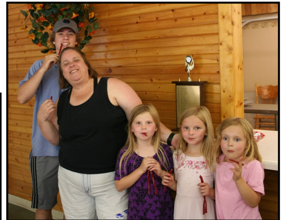
Eating a burger is a great way to suppress your appetite.