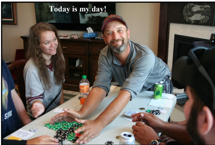
Today is my day!