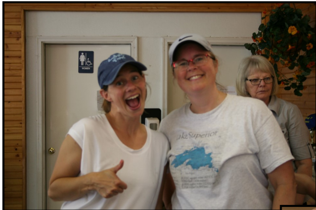
How do you know when it's time to tune the bagpipe?