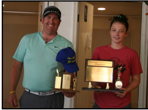
The 2021 Defenders