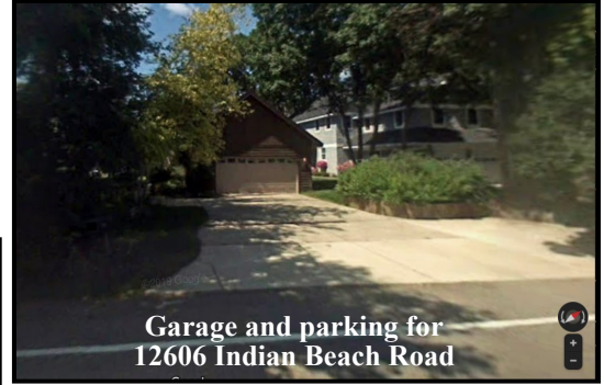
Garage and parking for 12606 Indian Beach Road

If you know how to fix hinges, my door is always open.