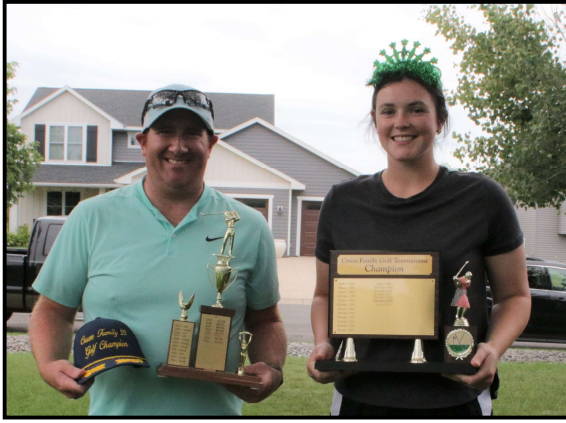
The 2023 Defenders

The Family Food Fest will be held at the Pavilion in Clear Lake.